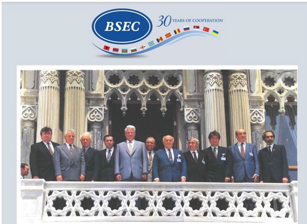
- Istanbul Summit, 25 June 1992 -