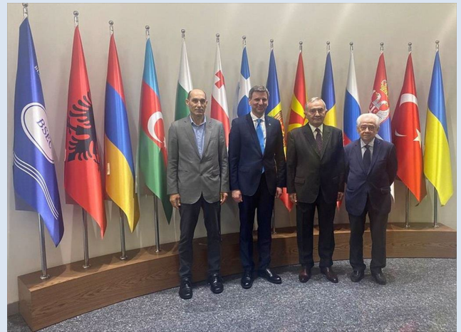
Courtesy visit by the FAO representative in Türkiye and Subregional Coordinator for Central Asia, Mr. Viorel Gutu, 25 May 2022.