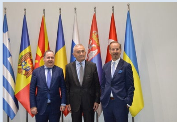
Courtesy visit by the Undersecretary for Foreign Policy from the Ministry of Foreign Affairs and Worship of the Argentine Republic, Mr. Claudio Javier Rozencwaig, 5 July 2022.

The Consuls General of the Republic of Bulgaria, the Russian Federation, Ukraine and the United States of America, also paid working visits to the Secretary General.