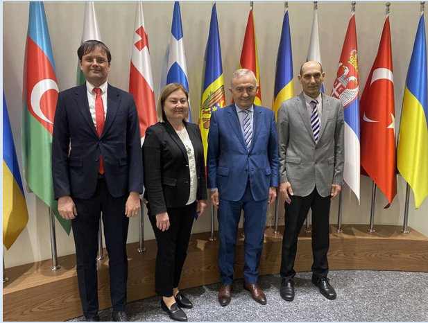
Courtesy visit by the Consul General of the Slovak Republic, Ms. Veronica Lambardini, 21 April 2022.