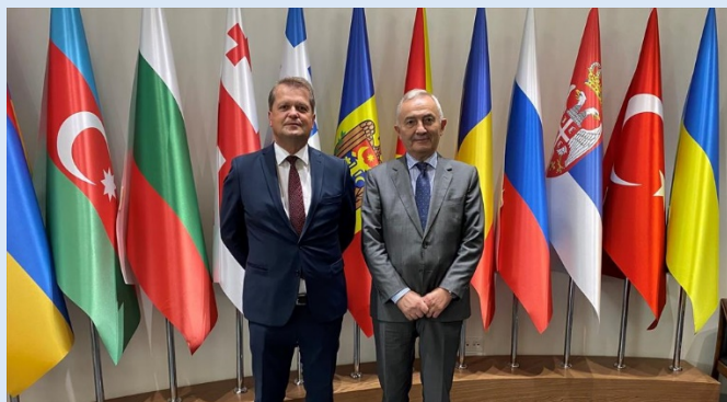
Courtesy visit by the Consul General of the Observer country Republic of Austria, Mr. Josef Saiger, 5 October 2021.