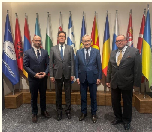
Angel Tcholakov, Ambassador of the Republic of Bulgaria in Ankara (BSEC Headquarters, 5 February 2025)