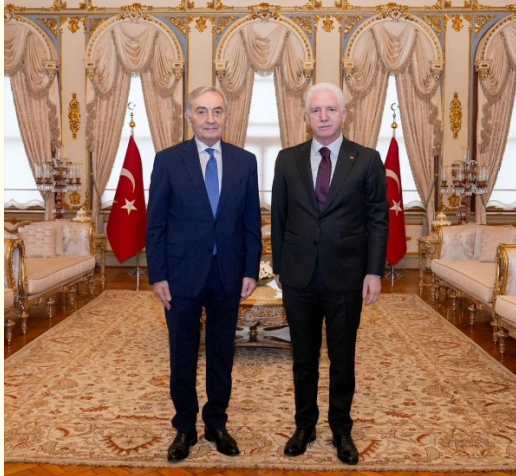
Courtesy visit to Mr. Davut Gül, Governor of Istanbul (Governorship, 4 March 2025)