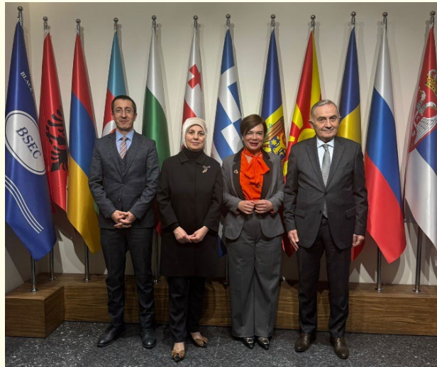
Visit by Ambassador Aylın Sekizkök, Director General for International Economic Affairs of the Ministry of Foreign Affairs of the Republic of Türkiye (BSEC Headquarters, 29 January 2025)