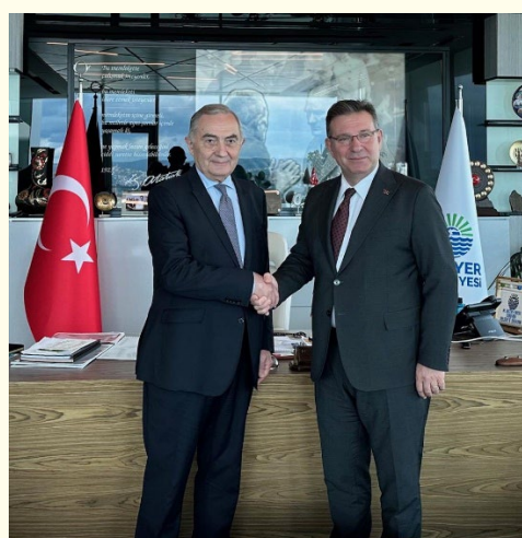
Visit to the Mayor of Sariyer Municipality (Istanbul) Mr. Mustafa Oktay Aksu (18 October 2024)