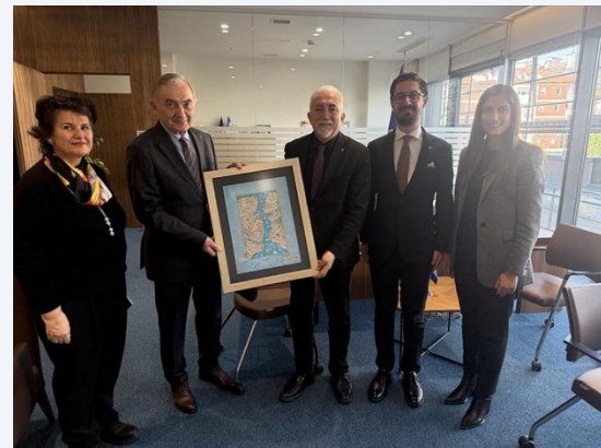
Visit by Mr. Hüseyin Coşkun, Deputy Mayor of Sarıyer (BSEC Headquarters, 22 January 2026)