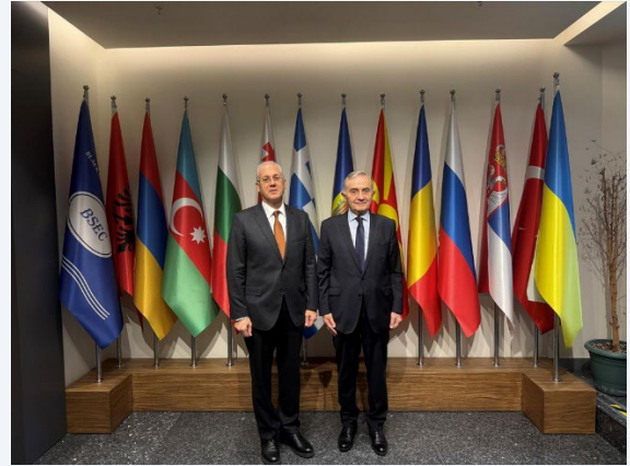
Courtesy visit by H.E. Wael Ibrahim Ali Badawi el Sheikh, Ambassador of the Arab Republic of Egypt to Ankara (BSEC Headquarters, 3 March 2026)