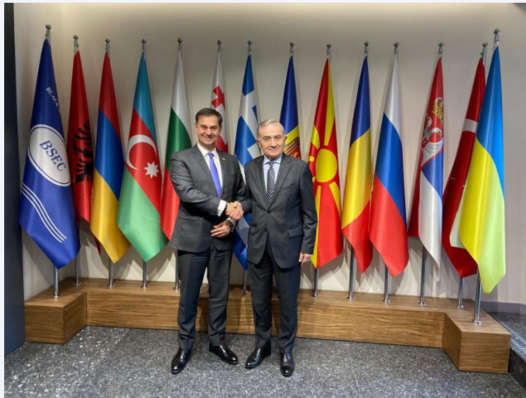
Working visit by Mr. Haris Theoharis, Deputy Minister of Foreign Affairs of the Hellenic Republic (BSEC Headquarters, 16 March 2026)